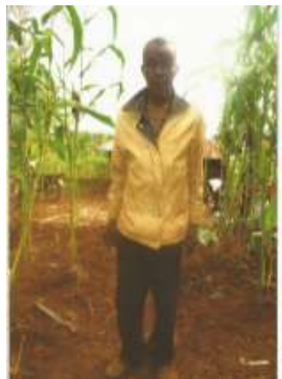
Trained widows, Youths and disadvantaged members of the community on sustainable farming