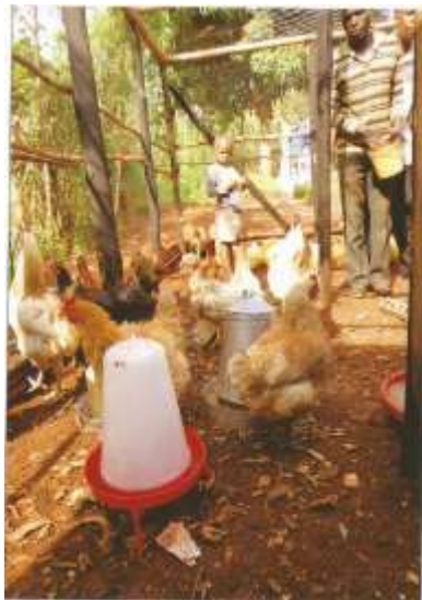
Feeding the chicken