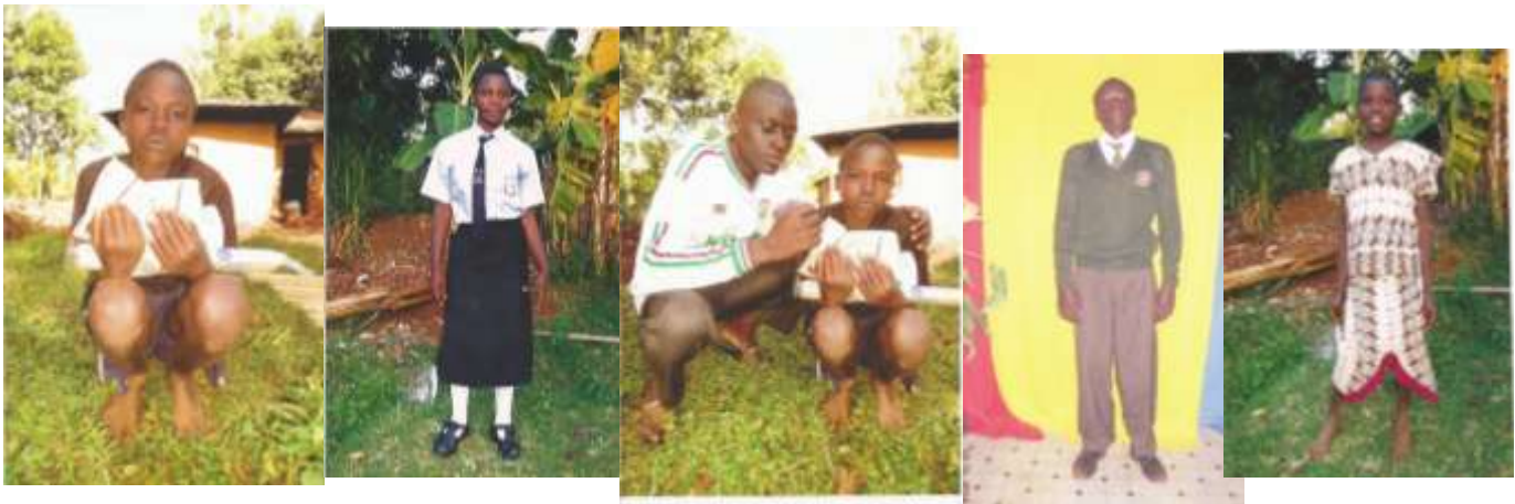
Some of the Orphans and vulnerable children supported by the group

a) Support to orphans, widows and the disadvantaged.