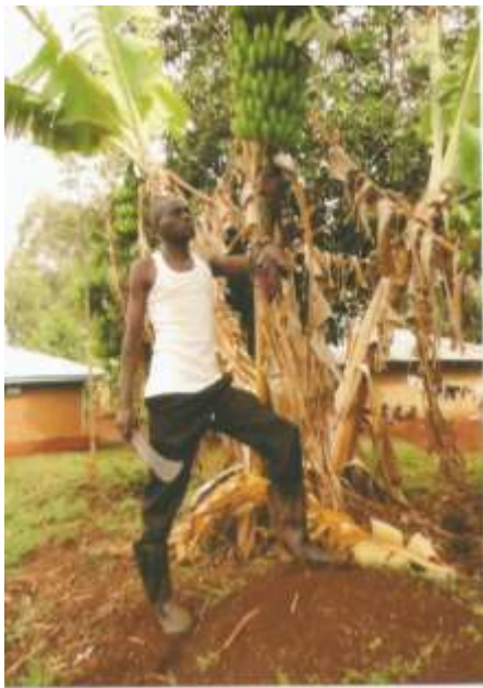
A member harvesting bananas