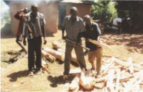
Members preparing firewood for market

Firewood is commonly used by the locals for cooking, so that makes its market readily available