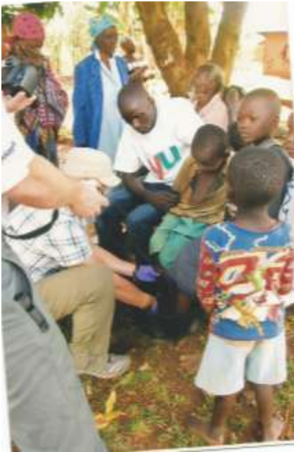
Volunteers from Canada washing the infected feet during anti jigger campaign