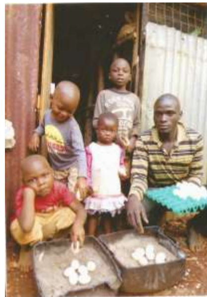
Produce from chicken made ready for market