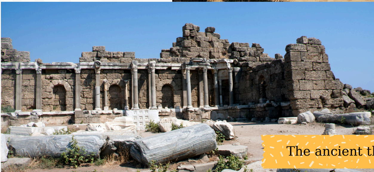
The ancient theatre