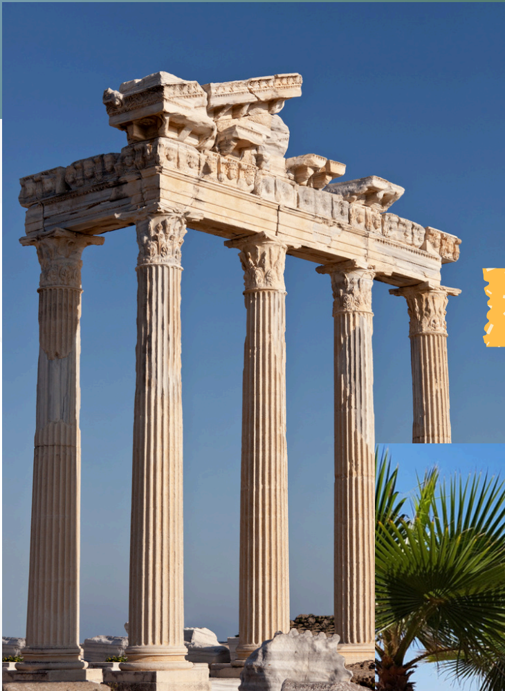
Temple of Apollo