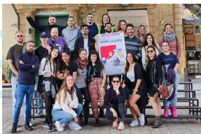
Theatre for Active Citizenship & Participation Youth Exchange, 12-17 December 2022

As NGO, our mission is to improve the level of competences and skills of young people and youth workers, as well as to foster intercultural learning, active citizenship and social inclusion through non-formal education principles and methodologies. Our vision is to empower youngsters to shape the world they live and work in, enhancing creativity, innovation and entrepreneurship . We want to help young people in their personal and professional growth to contribute to the sustainable development of European society