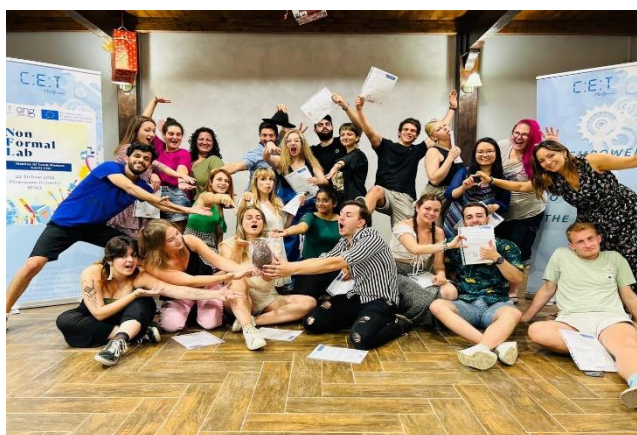
Non Formal Lab Training Course, 22-30 June 2022