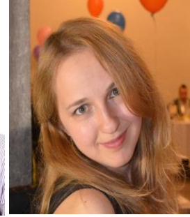
IVANNA LOGISTICS STAFF