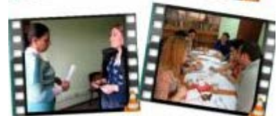
Role play simulation exercises