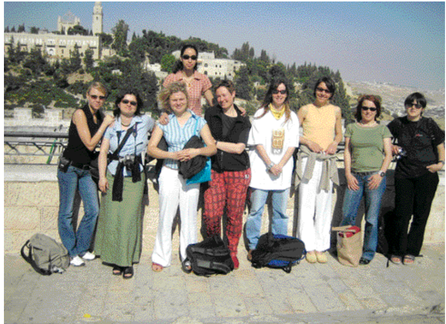
Study visit on Action 2 - 2005.

We also want to expand and consolidate the co-operation with our "twin countries" by planning common activities and support them