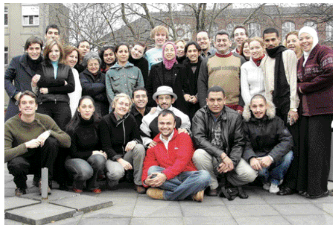
Salto Euromed "Step to" 2004.

with the re-structuring of the EuroMed programme in the Meda countries. Then this will be one of the biggest challenges for our Meda colleagues in the next years.